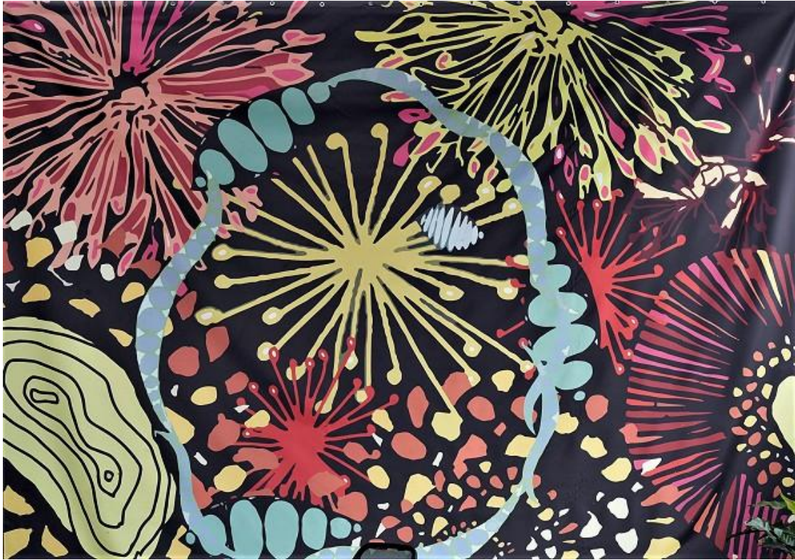
LANDSCAPES AND WHISPERS, CEMENTA 22

‘Landscapes’ (Rylstone Common) is a site-responsive work that considers invisible layers that exist within Australia’s landscapes, to activate seemingly hidden sites including dual histories and dual perspectives across times, marking 200 years since colonisation. In ‘Whispers’ (Combamalong Studios) spirits dance in the sheoaks, whispering songs of Country and stories of the constellations and the knowledge they hold when caring for Country. ‘Whispers’ is paying respects to our ancestors and continuing contemporary ceremonies.