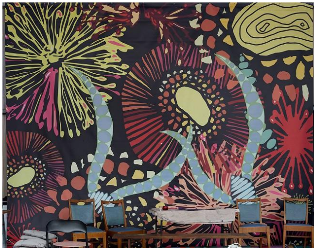
LANDSCAPES AND WHISPERS, CEMENTA 22

My artworks are based on my culture, people and surroundings, they tell stories of past and present by using contemporary methods and ideologies. My works include political statements and educational information regarding Aboriginal issues, a subject which I am extremely passionate about. I use different mediums for my works including drawing, ceramics, printmaking and animation.